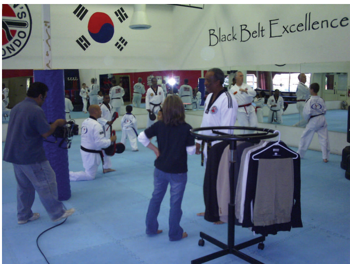
Robinson's TDK promoting Suit Up Dad Program on KCRA