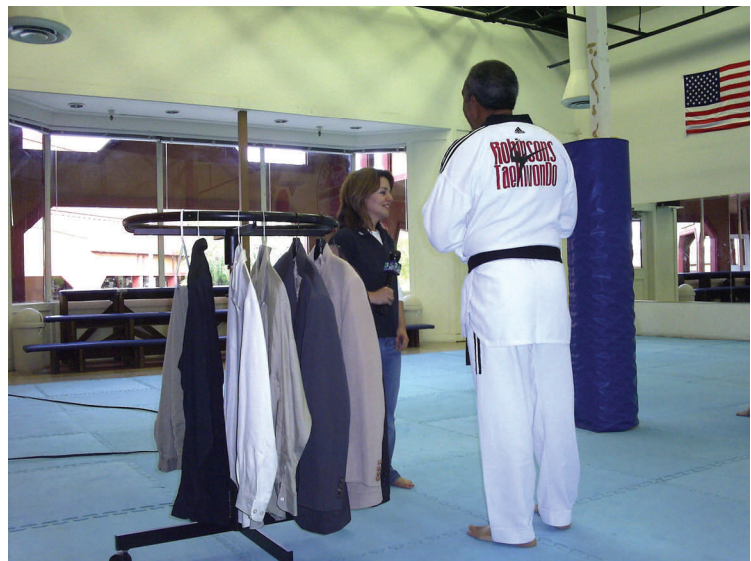
Kicking off the Suit Up Dads drive