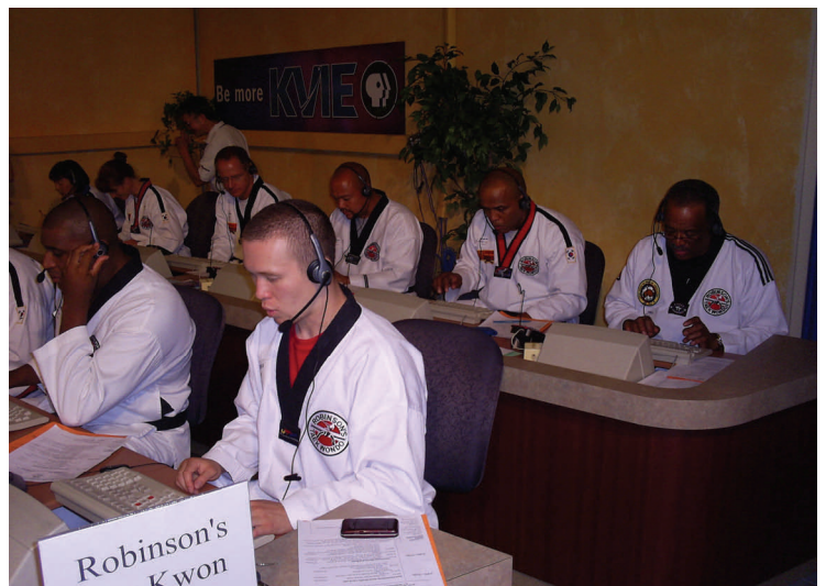
KVIE Phone Bank