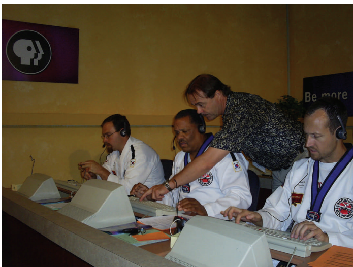
Robinson's TKD volunteering at the KVIE Phone Bank