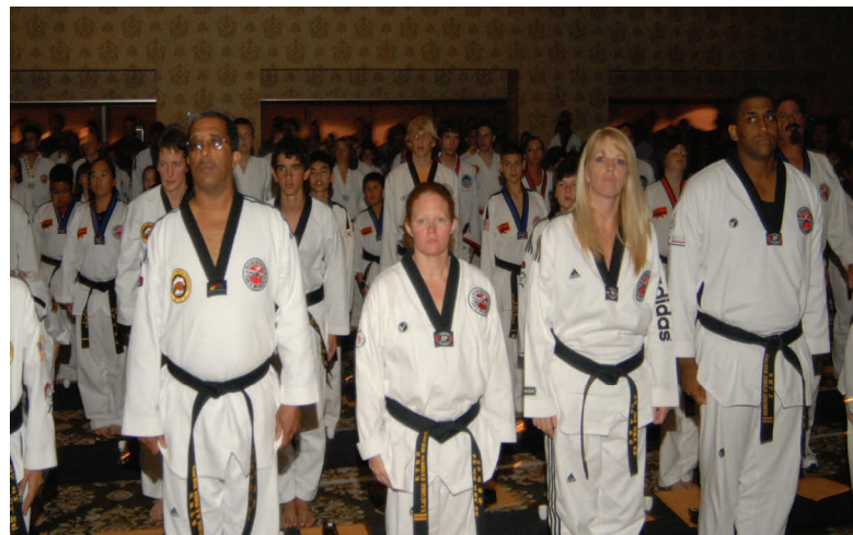
Preparing for the Black Belt Exhibition