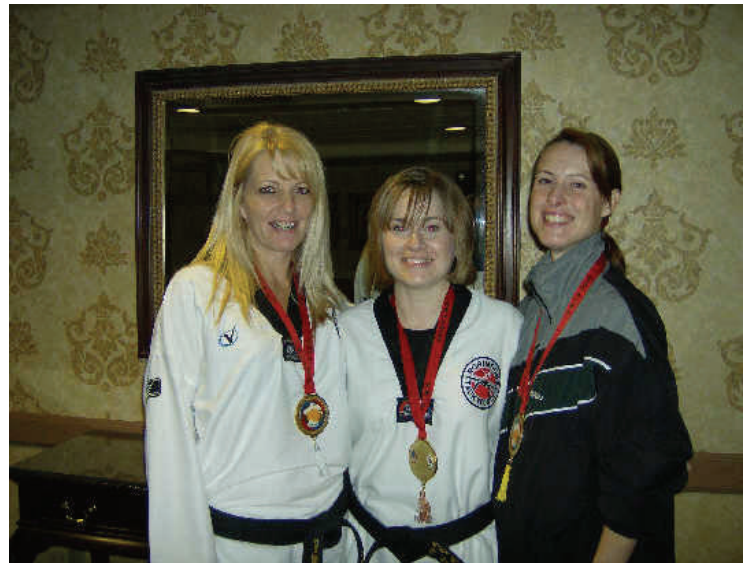
UWTA Pomsae Champions