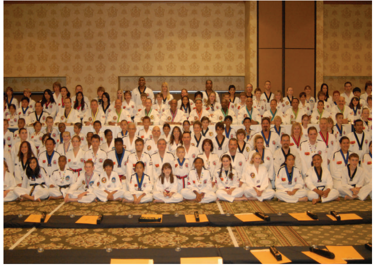
Black Belt Testing Participants and Officials