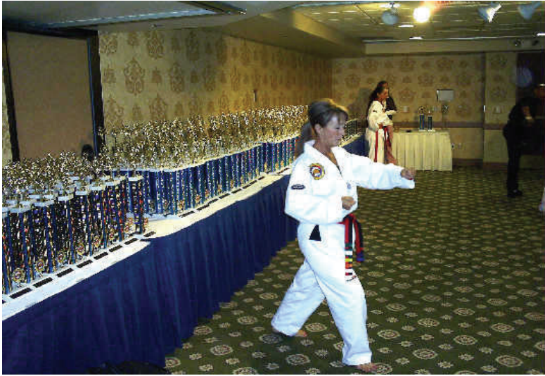
UWTA National Championship Trophies