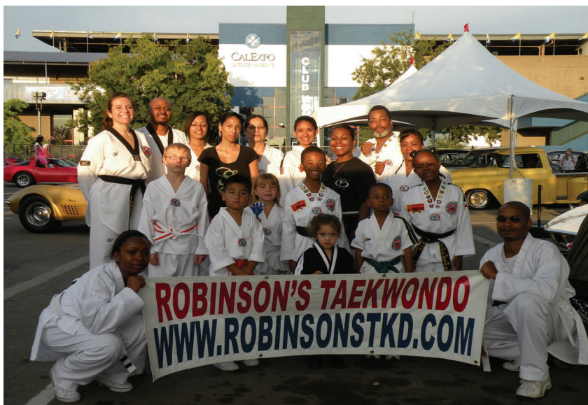
Florin Road students at the California State Fair