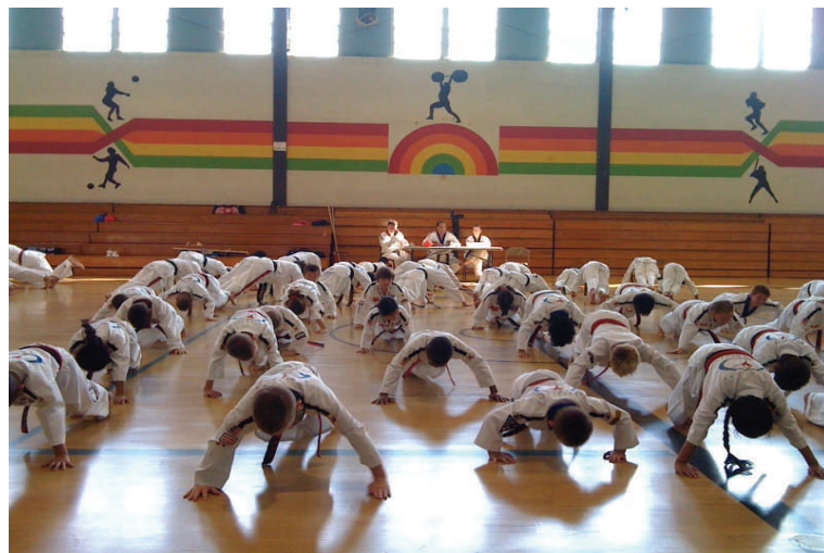
Black Belt pre-test at Mather Sports Complex